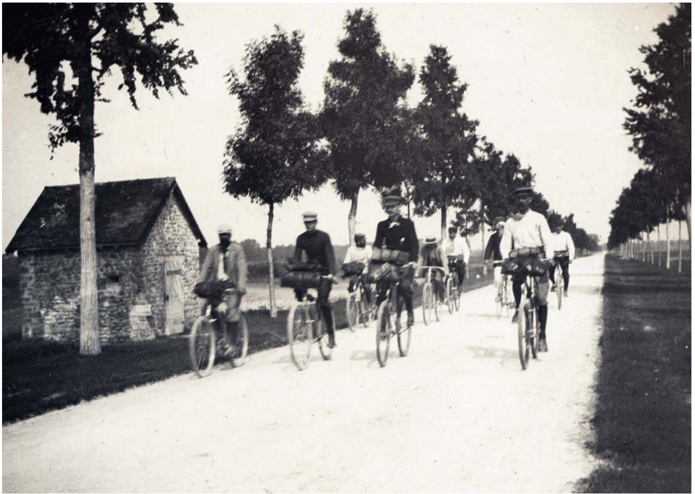
Final Frame - Side by Side on French Road by J. H. Lamson