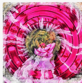
"Wreath and Ribbon" Image by Susan Partridge